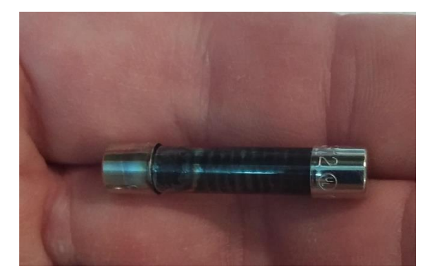
Figure 3 - What a thoroughly blowed-up fuse might look like.

Sure enough, the line fuses were blown. In fact, they were most blowed-up fuses Iøve seen in a while (see Figure 3). Being a skilled and experienced engineer, my visual examination was enough to