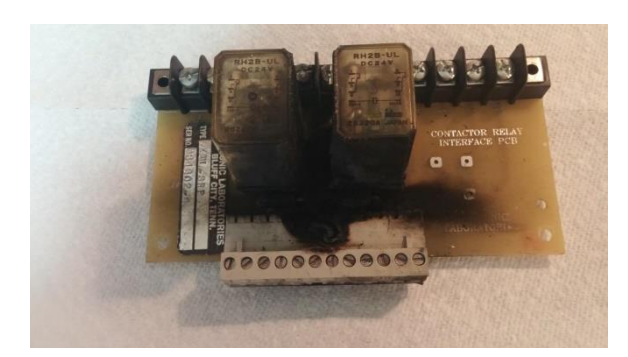
Figure 1 - I guess we took a bite of lightning ...

of the big RF contactors inside the phasor was buzzing and humming whenever we tried to switch patterns.