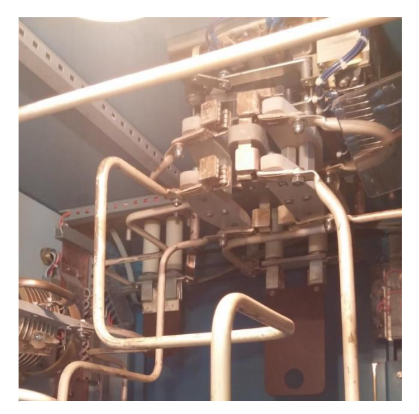
Figure 2 - Getting to the contactor inside the phasor requires ... agility.

Getting to contactor K3 in that phasor is fun (see Figure 2). It is surrounded by plumbing, so my task was complicated by the fact that we wanted to stay on air while I did the work. Thank the Lord, Jack and I were able to get the old board out for closer examination without a whole lot of trouble. I discovered that the contacts on one relay had arcwelded themselves into a permanent õonö condition.